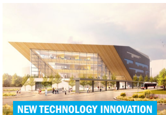
NEW TECHNOLOGY INNOVATION BUILDING - NORTH CAMPUS