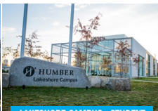
LAKESHORE CAMPUS - STUDENT WELCOME AND RESOURCE CENTRE