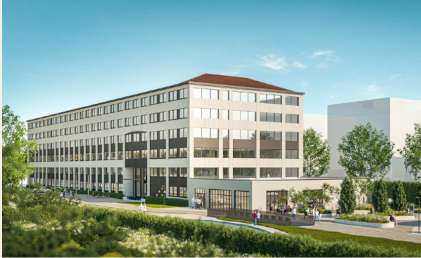
New CBS campus opening in Spring 2024*