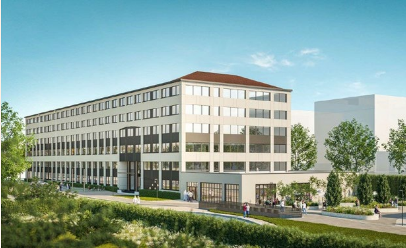
New CBS campus