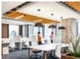
DOWNTOWN CAMPUS - INTERNATIONAL GRADUATE SCHOOL (IGS)