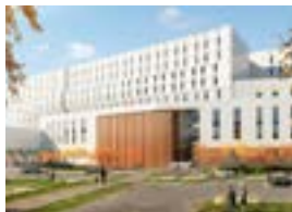
LAKESHORE CAMPUS - HUMBER CULTURAL HUB