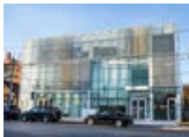
LAKESHORE CAMPUS - FITNESS CENTRE