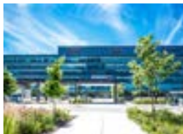
NORTH CAMPUS - LEARNING RESOURCE COMMONS