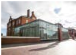
LAKESHORE CAMPUS - LONGO CENTRE FOR ENTREPRENEURSHIP