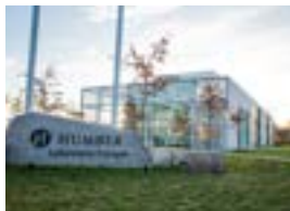
LAKESHORE CAMPUS - STUDENT WELCOME AND RESOURCE CENTRE