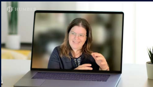
The Move to Ultra | The Faculty Journey (5:53)

Check out these celebratory videos. Listen to your Humber colleagues share their stories. Hear what surprised them, what they learned, and what made them dance with joy!