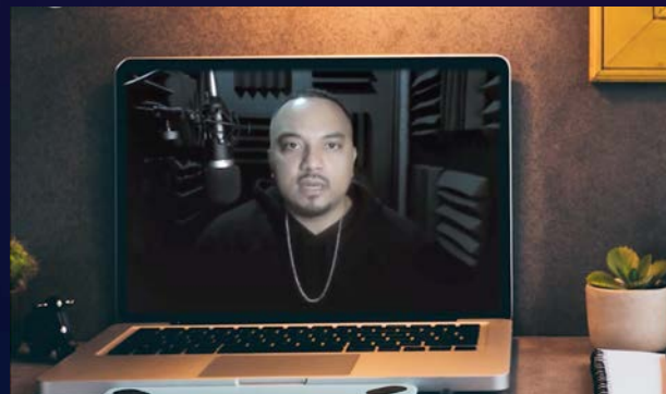
The Move to Ultra | Insights from Faculty (3:56)