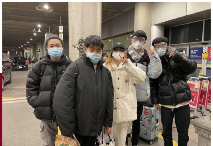
Ningbo students arrival

Find out what they have been doing since they arrived >