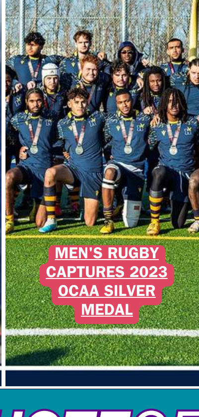
MEN'S RUGBY CAPTURES 2023 OCAA SILVER MEDAL