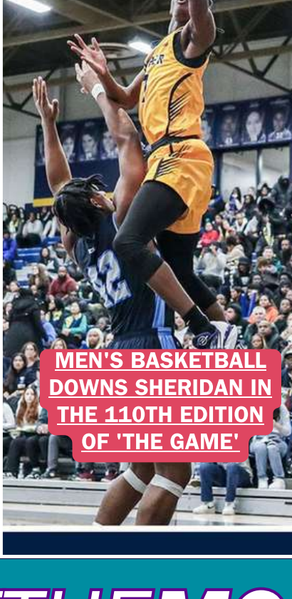
MEN'S BASKETBALL DOWNS SHERIDAN IN THE 110TH EDITION OF 'THE GAME'