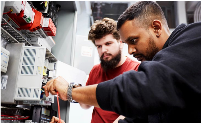
Occupational Health & Safety and Quality Insurance Info Session