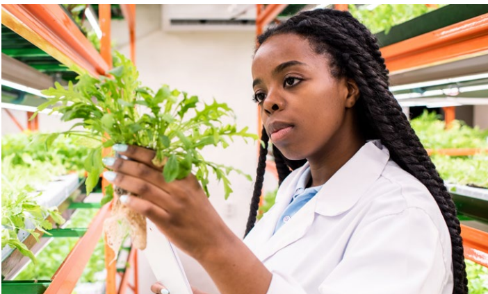
Horticultural Science Info Session