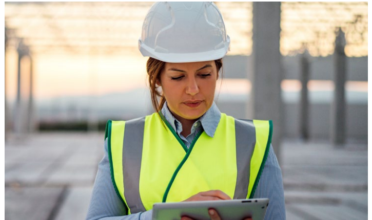
Project Management and Construction Management Info Session