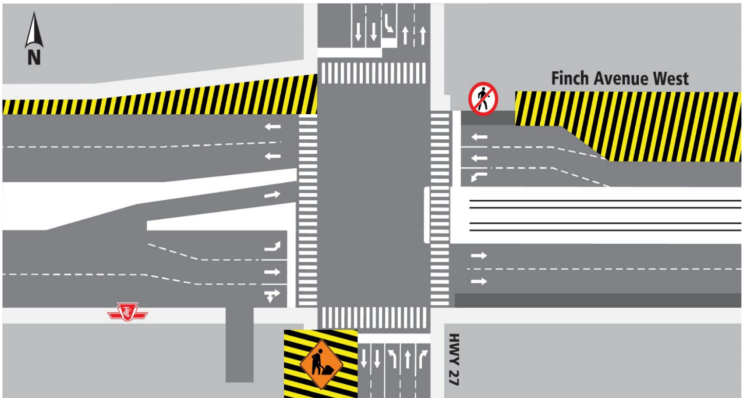
Map 1 Description: Hwy 27 and Finch Avenue West. Minor sidewalk works starting April 10, 2025, and will last for seven (7) days, approximately.