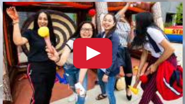
2019-2020 HUMBER HIGHLIGHTS