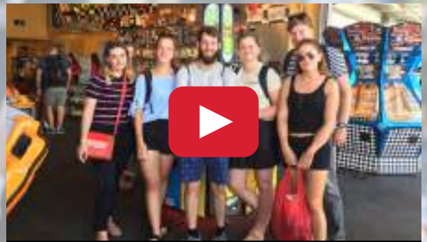
HUMBER 2022 GLOBAL SUMMER SCHOOL