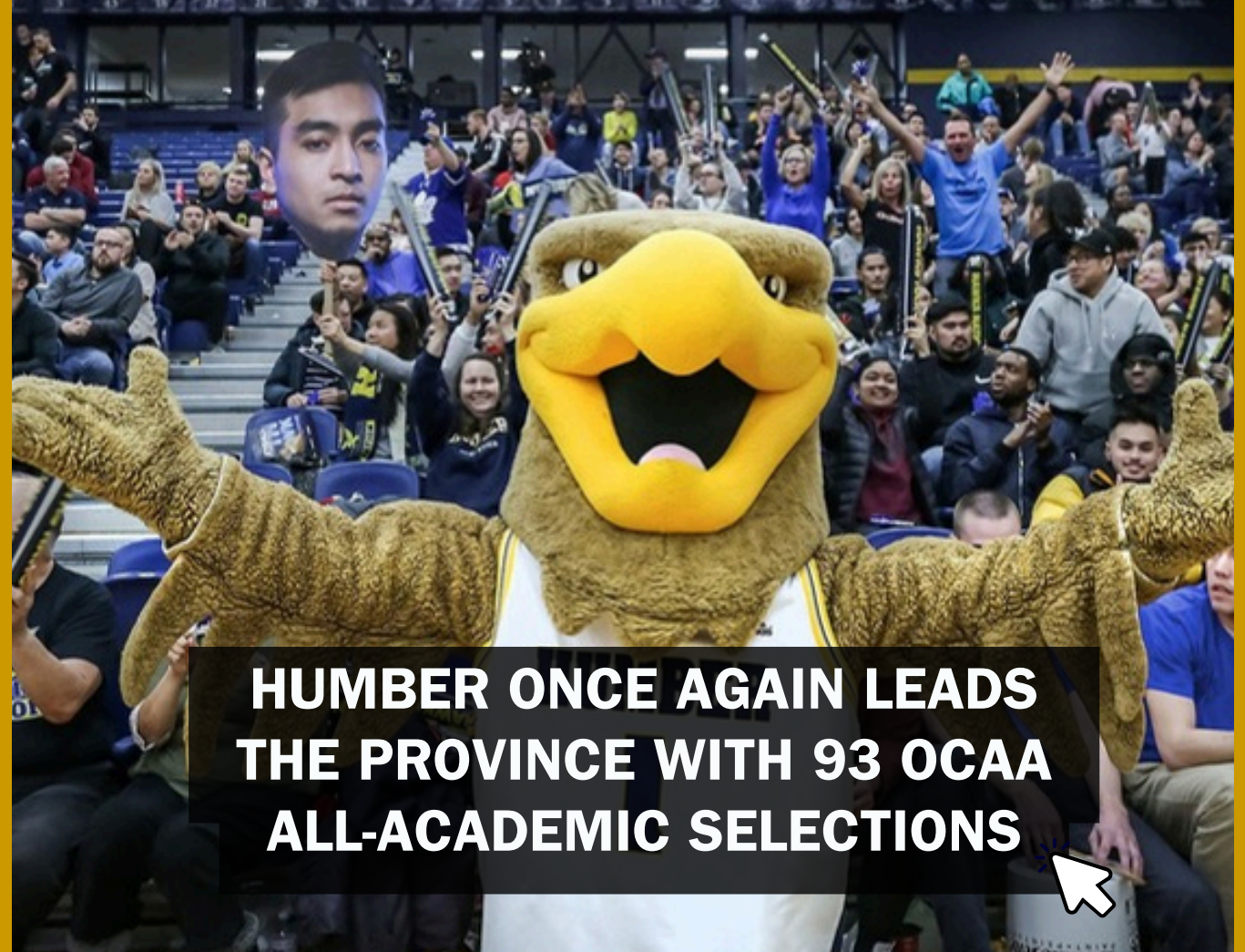
HUMBER ONCE AGAIN LEADS THE PROVINCE WITH 93 OCAA ALL-ACADEMIC SELECTIONS