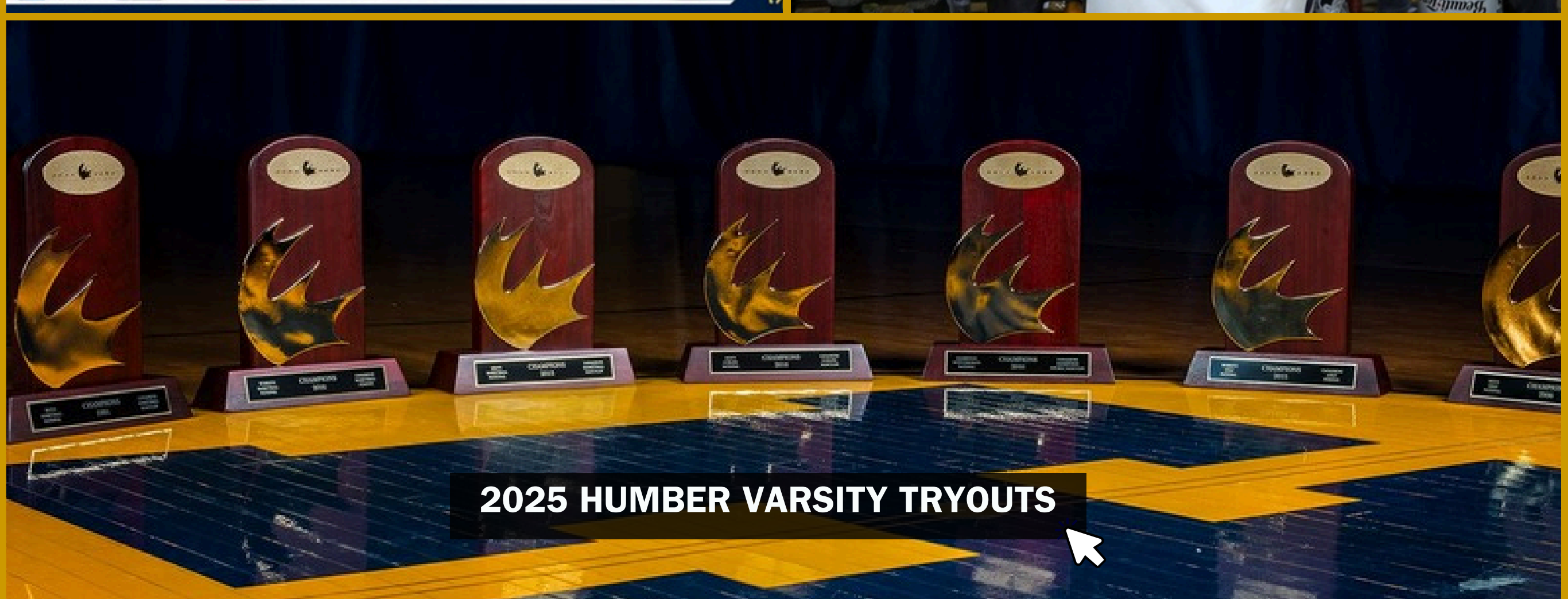
2025 HUMBER VARSITY TRYOUTS