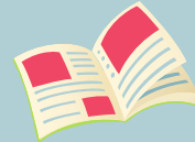
Magazines & Notebooks