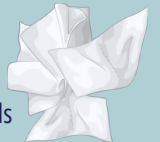
Napkins & Paper Towels