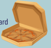
Contaminated Cardboard or Takeout Boxes