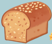
Bread & Grain Products